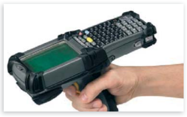
Consumption of raw materials and production order receipts through bar code scanning.