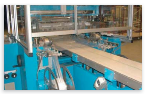
Scanning items on an assembly line is possible with a fixed-mount scanner.